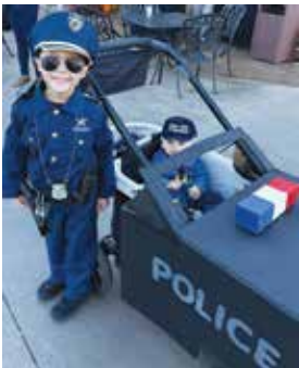
The Persing Brothers.