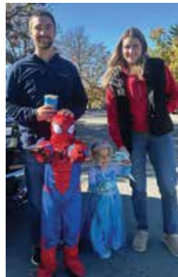
The Debo Family.