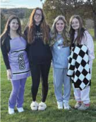
The Beaver Girls Golf Team.