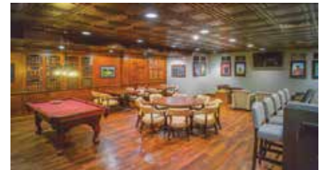
THE CHAMPIONS LOUNGE

Located within the Grille Room. Seats 10 people for an intimate gathering.