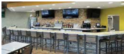
ADULT BAR AT THE POLL

What a great place to enjoy the outdoors while dining at your favorite country club. Entertainment every Friday from May through October. Weather permitting.