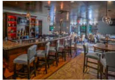
GRILLE ROOM BAR

A full service bar encompassed by our Grille Room. There is a full selection of Bourbon, Scotch and other delights. Open during regular Grille Room hours and while golfers are still on the golf course.