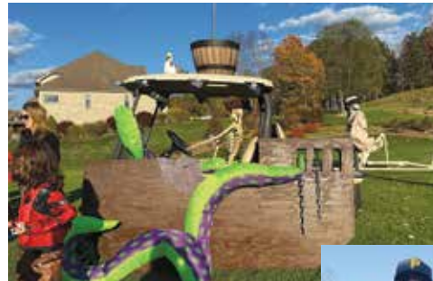
The Pirate Ship.