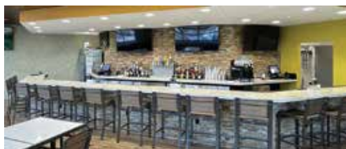
ADULT BAR AT THE POLL

What a great place to enjoy the outdoors while dining at your favorite country club. Entertainment every Friday from May through October. Weather permitting.