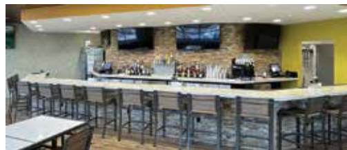
ADULT BAR AT THE POOL Open from Memorial Day through Labor Day.

What a great place to enjoy the outdoors while dining at your favorite country club. Entertainment every Friday from May through October. Weather permitting.