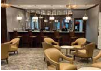
SYCAMORE BAR AND PATIO

For your enjoyment Seven Oaks has many beverage areas for you to choose from: