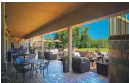
GRILLE ROOM PATIO

GRILLE ROOM BAR A full service bar encompassed by our Grille Room. There is a full selection of Bourbon, Scotch and other delights. Open during regular Grille Room hours and while golfers are still on the golf course.