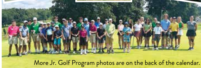
More Jr. Golf Program photos are on the back of the calendar.