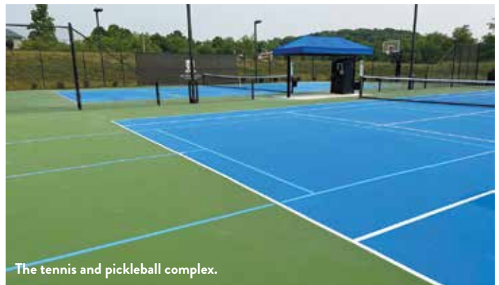
The tennis and pickleball complex.