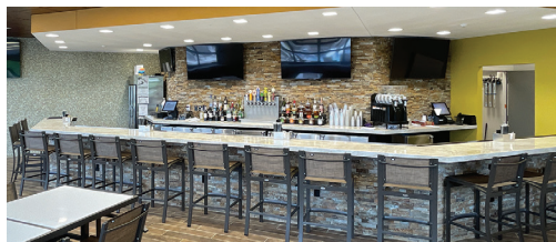
ADULT BAR AT THE POLL

What a great place to enjoy the outdoors while dining at your favorite country club. Entertainment every Friday from May through October. Weather permitting.