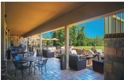
GRILLE ROOM PATIO

A full service bar encompassed by our Grille Room. There is a full selection of Bourbon, Scotch and other delights. Open during regular Grille Room hours and while golfers are still on the golf course.