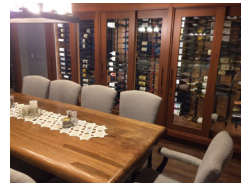
THE WINE ROOM

A full service bar encompassed by our Grille Room. There is a full selection of Bourbon, Scotch and other delights. Open during regular Grille Room hours and while golfers are still on the golf course.