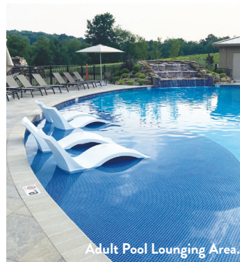
Adult Pool Lounging Area.