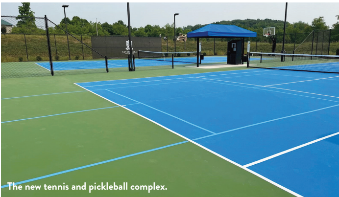
The new tennis and pickleball complex.