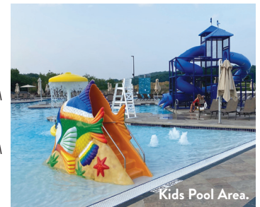
Kids Pool Area.

Pool hours may change at the end of August due to school starting.