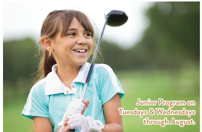
Junior Program on Tuesdays & Wednesdays through August.

Our Junior Program is off to a great start with 96 kids! We are on the driving range and golf course on Tuesdays and Wednesdays through the second week of August.