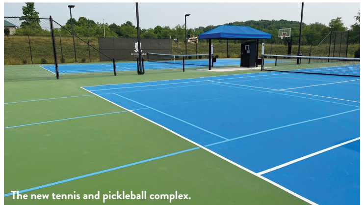
The new tennis and pickleball complex.