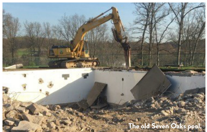
The old Seven Oaks pool.

Lots of good memories have been made here since 1979 when this pool opened and now we are ready to start making new memories as our new swimming and racquet complex is set to open.