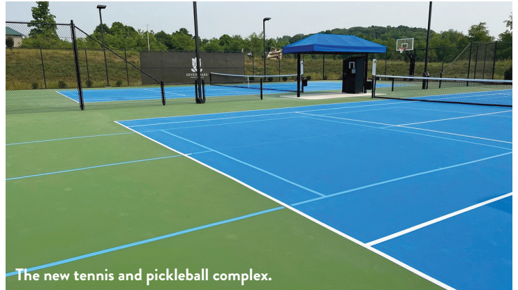
The new tennis and pickleball complex.