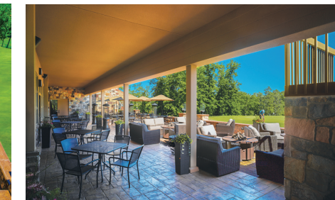
GRILLE ROOM PATIO

What a great place to enjoy the outdoors while dining at your favorite country club. Entertainment every Friday from May through September. Weather permitting.