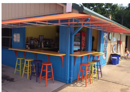
SOAKS POOL BAR

Our Cigar Bar where you can enjoy the game, a good cigar, and great food along with a game of pool or darts. Those ages 19 & 20 are permitted in the room and those 18 and under must be accompanied by a parent.