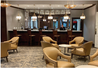
SYCAMORE BAR AND PATIO

For your enjoyment Seven Oaks has many beverage areas for you to choose from: