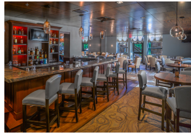
GRILLE ROOM BAR

A full service bar encompassed by our Grille Room. There is a full selection of Bourbon, Scotch and other delights. Open during regular Grille Room hours and while golfers are still on the golf course.