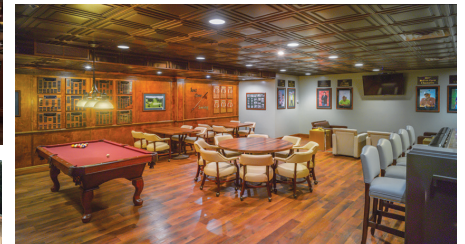
THE CHAMPIONS LOUNGE

Our Cigar Bar where you can enjoy the game, a good cigar, and great food along with a game of pool or darts. Those ages 19 & 20 are permitted in the room and those 18 and under must be accompanied by a parent.