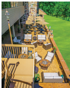
GRILLE ROOM PATIO

From Memorial Day until Labor Day join us at our bar pool side.