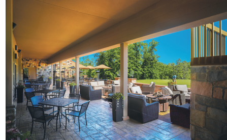
GRILLE ROOM PATIO

What a great place to enjoy the outdoors while dining at your favorite country club. Entertainment every Friday from May through September. Weather permitting.