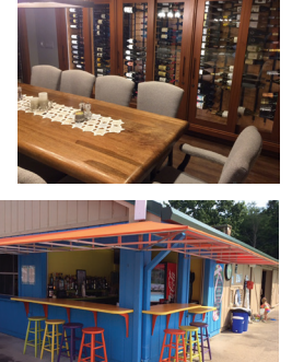
SOAKS POOL BAR From Memorial Day until Labor Day join us at our bar pool side.

GRILLE ROOM BAR A full service bar encompassed by our Grille Room. There is a full selection of Bourbon, Scotch and other delights. Open during regular Grille Room hours and while golfers are still on the golf course.