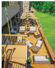
GRILLE ROOM PATIO

Our Cigar Bar where you can enjoy the game, a good cigar, and great food along with a game of pool or darts. Those ages 19 & 20 are permitted in the room and those 18 and under must be accompanied by a parent.