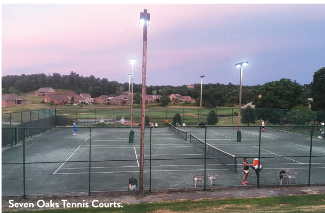
Seven Oaks Tennis Courts.