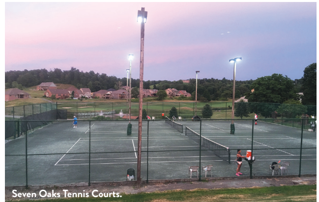
Seven Oaks Tennis Courts.