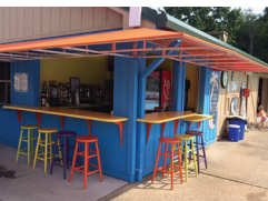
SOAKS POOL BAR

From Memorial Day until Labor Day join us at our bar pool side.