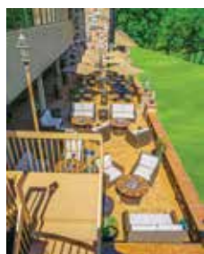
GRILLE ROOM PATIO

Our Cigar Bar where you can enjoy the game, a good cigar, and great food along with a game of pool or darts. Those ages 19 & 20 are permitted in the room and those 18 and under must be accompanied by a parent.