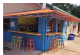
SOAKS POOL BAR

From Memorial Day until Labor Day join us at our bar pool side.