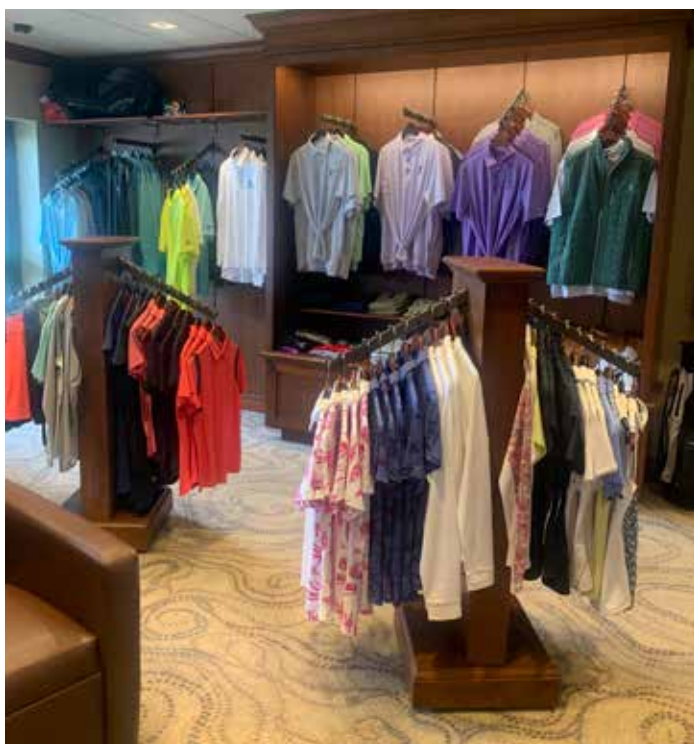
Please stop in to check out our newly renovated Golf Shop with merchandise for the golfer and non golfer alike.

The sand bottles on the carts are to fill tee and fairway divots. After filling the divot, the sand must be leveled with your foot to make the sand level with the existing grade of turf. If sand is mounded and not level, then the fairway and tee mowers chew up the sand and this dulls their blades. The dull mower blades then rip the grass and cause an entry way for disease and reduce the overall appearance of the fairways and tees.