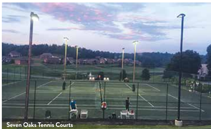
Seven Oaks Tennis Courts