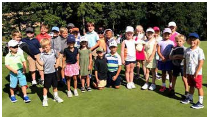
A few of the kids who participated in the 2021 Junior program.

A quick "Thank you" needs to go out to all the kids, parents, coaches and employees that helped our Junior Program this year. We had a total of 65 kids that participated in our 6-week program that finished up on August 11 th . Everyone had a blast and we saw improvement in each child. Hopefully it will only grow year after year!