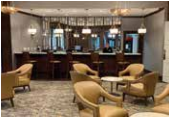
SYCAMORE BAR AND PATIO

For your enjoyment Seven Oaks has many beverage areas for you to choose from: