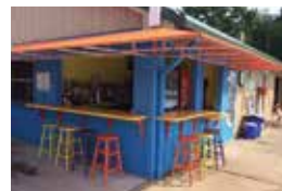
SOAKS POOL BAR

Our Cigar Bar where you can enjoy the game, a good cigar, and great food along with a game of pool or darts. Those ages 19 & 20 are permitted in the room and those 18 and under must be accompanied by a parent.