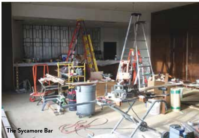
The Sycamore Bar

When the Club first opened this was the room where members could go and relax and enjoy a beverage. I remember when I started working the two draft beers were Strohs and Iron City Light. The reason I remember this is that both of those beer kegs were round with no holes to pick them up. I also remember the sign outside of the room that said "Jackets required after 6". I anticipate a lot of good times in this room in the future.