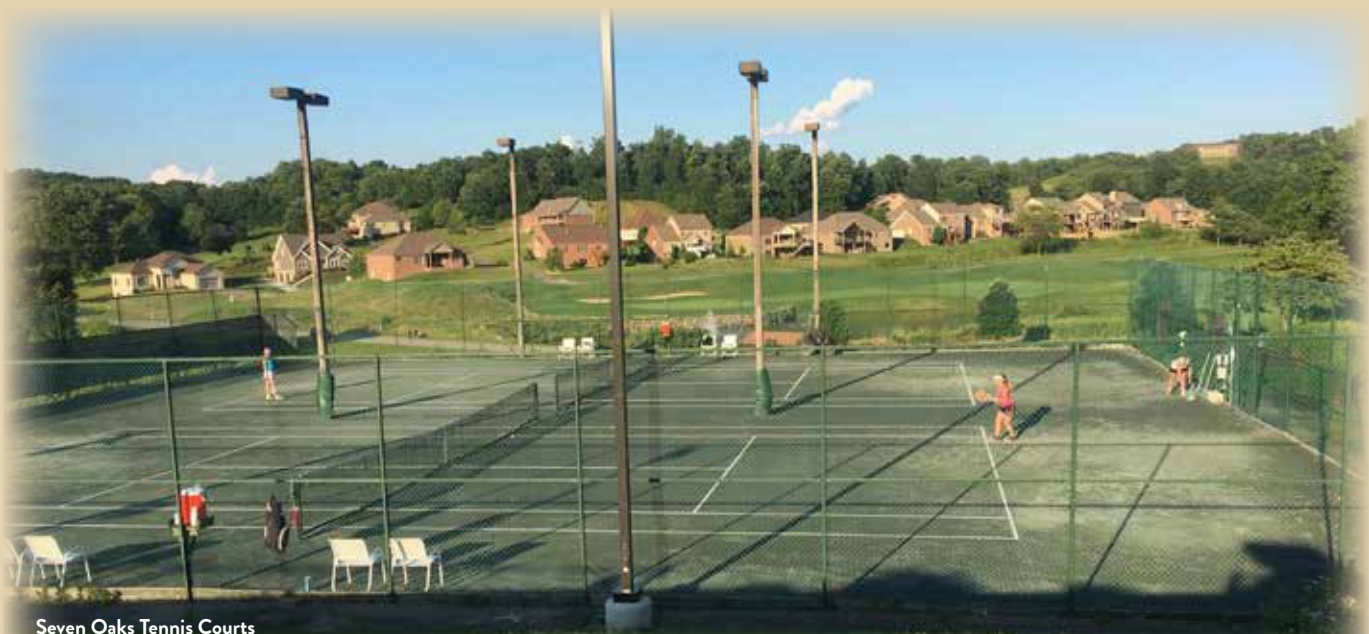
Seven Oaks Tennis Courts