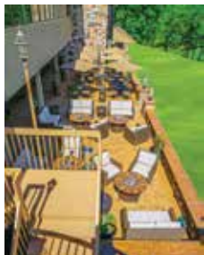
GRILLE ROOM PATIO

Our Cigar Bar where you can enjoy the game, a good cigar, and great food along with a game of pool or darts. Those ages 19 & 20 are permitted in the room and those 18 and under must be accompanied by a parent.