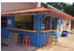
SOAKS POOL BAR

From Memorial Day until Labor Day join us at our bar pool side.