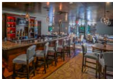
GRILLE ROOM BAR

What a great place to enjoy the outdoors while dining at your favorite country club. Entertainment every Friday from May through September. Weather permitting.