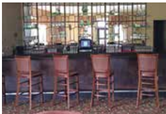
SYCAMORE BAR AND PATIO

For your enjoyment Seven Oaks has many beverage areas for you to choose from: