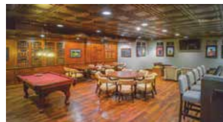
THE CHAMPIONS LOUNGE

From Memorial Day until Labor Day join us at our bar pool side.