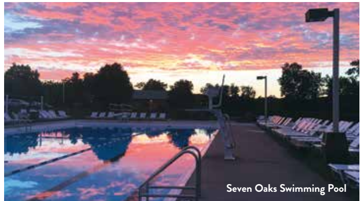
Seven Oaks Swimming Pool

Our final night swim of the season is scheduled for Saturday, August 14, so why not plan to spend the evening under the stars at the swimming pool? The snack shop will be open until 9 PM and the Soaks Bar will stay open until 10 PM.