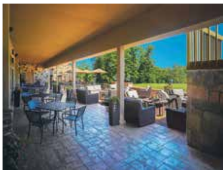
GRILLE ROOM PATIO

What a great place to enjoy the outdoors while dining at your favorite country club. Weather permitting.