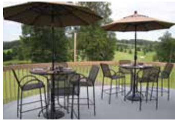
SYCAMORE BAR AND PATIO

A great view of the course as you overlook the putting green and watch as everyone goes off #1 tee and as they come up #18. Weather permitting.