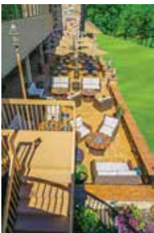
GRILLE ROOM PATIO

Our Cigar Bar where you can enjoy the game, a good cigar, and great food along with a game of pool or darts. Those ages 19 & 20 are permitted in the room and those 18 and under must be accompanied by a parent.