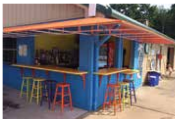
SOAKS POOL BAR

What a great place to enjoy the outdoors while dining at your favorite country club. Weather permitting.