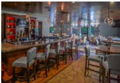
GRILLE ROOM BAR

A full service bar encompassed by our Grille Room. There is a full selection of Bourbon, Scotch and other delights. Open during regular Grille Room hours and while golfers are still on the golf course.