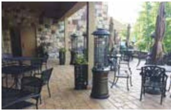
GRILLE ROOM PATIO

From Memorial Day until Labor Day join us for summer time enjoyment.