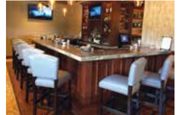
THE CHAMPIONS LOUNGE

A full service bar encompassed by our Grille Room. There is a full selection of Bourbon, Scotch and other delights. Open during regular Grille Room hours and while golfers are still on the golf course.