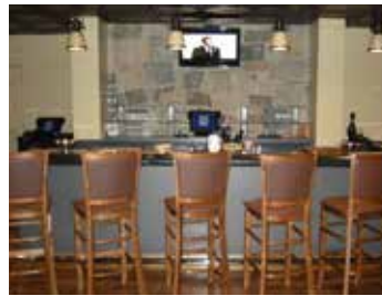
SOAKS POOL BAR

Our Cigar Bar where you can enjoy the game, a good cigar, and great food along with a game of pool or darts. Those ages 19 & 20 are permitted in the room and those 18 and under must be accompanied by a parent.