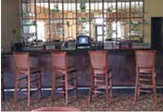
SYCAMORE BAR AND PATIO

For your enjoyment Seven Oaks has many beverage areas for you to choose from: