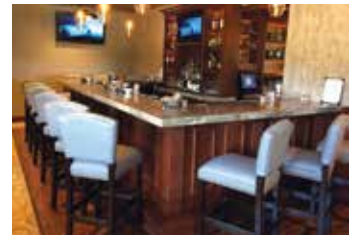
THE CHAMPIONS LOUNGE

A full service bar encompassed by our Grille Room. There is a full selection of Bourbon, Scotch and other delights. Open during regular Grille Room hours and while golfers are still on the golf course.