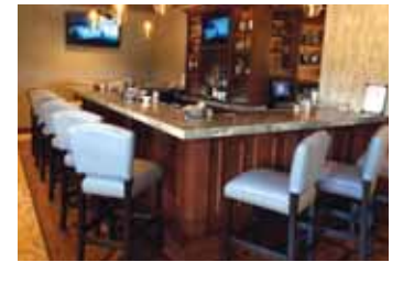
SOAKS POOL BAR From Memorial Day until Labor Day join us for summer time enjoyment.

A full service bar encompassed by our Grille Room. There is a full selection of Bourbon, Scotch and other delights. Open during regular Grille Room hours and while golfers are still on the golf course.